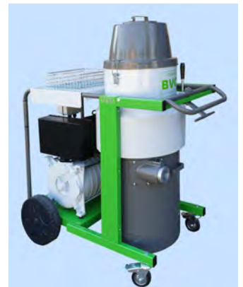
Ti60 unit 4kW