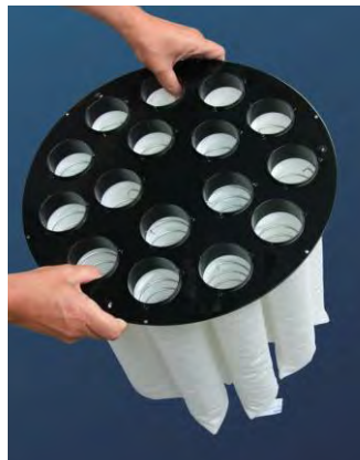
BVC 'ClearFlow' filter