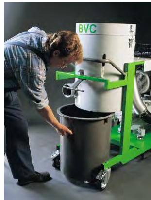
Easy bin emptying