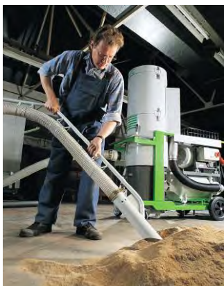
Bulk spillage collection