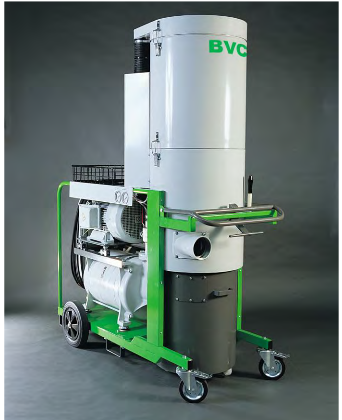
Centurion Ti80 with large 6.5 sq. metre 'Clearflow' filter pack